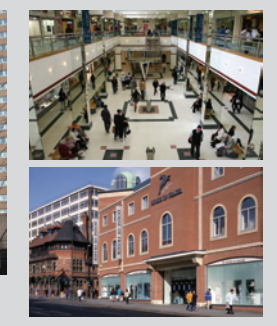
Victoria Clock Tower. Right, Victoria Centre.