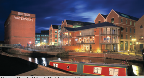
Above, Castle Wharf. Right, Inland Revenue Below right, Nottingham Railway Station