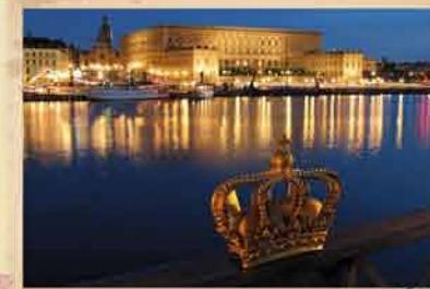
Stockholm – The Capital of Scandinavia