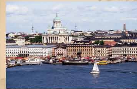
Helsinki – World Design Capital 2012